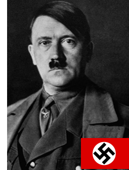
Adolf Hitler was the leader of the Nazi party and the leader of Germany.