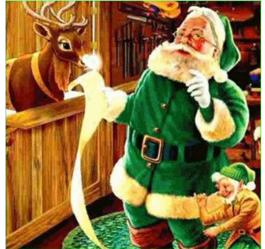
This is an image of how Santa was portrayed in a green outfit.