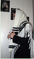
Talit Jewish Prayer shawl