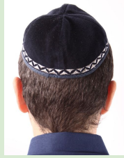
Kippah Jewish skullcap