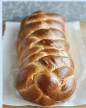
Challah , a special sweet bread