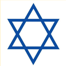
Star of David Jewish