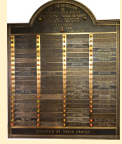
Memorial Boards To remember Jewish people who have died.