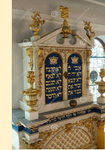
Ark Special cupboard where the Torah is kept.