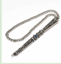
Yad Jewish pointer to help read the Torah