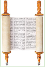
Torah Jewish Holy Book