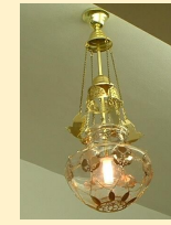
Eternal Light This is always lit.