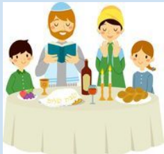
Cleaning the house and putting on special clothes.