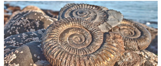
Ammonites are a frequent find for fossil hunters