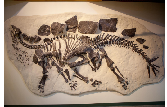
Dinosaur fossils help us learn about the past

https://www.nhm.ac.uk/schools/teaching-resources/key-stage-2/rock-ks-fossils-and-dinosaurs.html