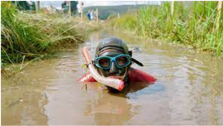
Bog snorkeling is not for everyone!

orb, typically made of transparent plastic.