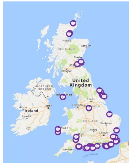
There are many areas that fossils can be found across the UK