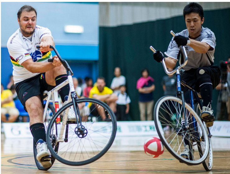
Cycle ball is fast paced and known as an intense sport.

Cycle ball is truly an unusual sport. It is basically cycling but also while attempting to pass the ball successfully to another player. It is like football but on a bike and only 2 players are allowed on each team.