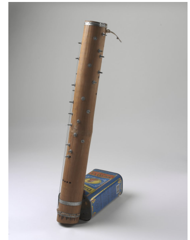
Dan Tre instruments