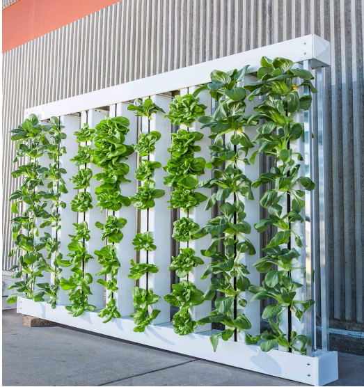
Living walls can help Urban areas become more green and improve air quality.

Although our school focuses greatly on being as eco-friendly as possible, there is still a long way to go and this article is all about how YOU can do your part and help our school go green.