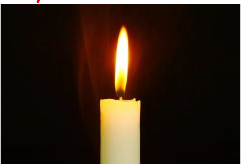
Wednesday, 21st February, 2024