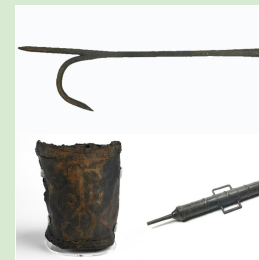
Fire fighting in the 1600s

13,000 houses and 87 churches, including St Paul's Cathedral, were burned down. It took 50 years to rebuild London with wider , safer streets and more stone and brick buildings. A monument was built in Pudding Lane to remember the fire.