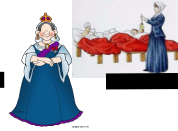
The Victorians 1800s