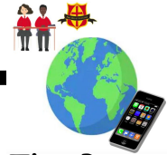
The Present Day 2000s