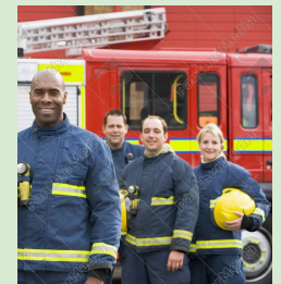
Fire fighting today.