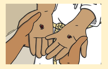
Doubting Thomas Jesus appeared to Thomas who was unsure.