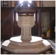
Font: used for baptisms