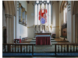
Sanctuary: the front of the church where the altar is.