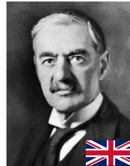
Neville Chamberlain was the Prime Minister of Britain who declared war on Germany on September 3rd 1939.