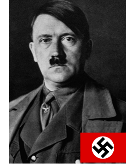
Adolf Hitler was the leader of the Nazi party and the leader of Germany.