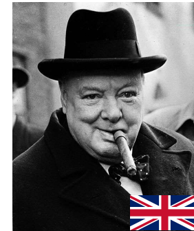
Winston Churchill became Prime Minister of Britain in May 1940 and led Britain for the rest of the war.